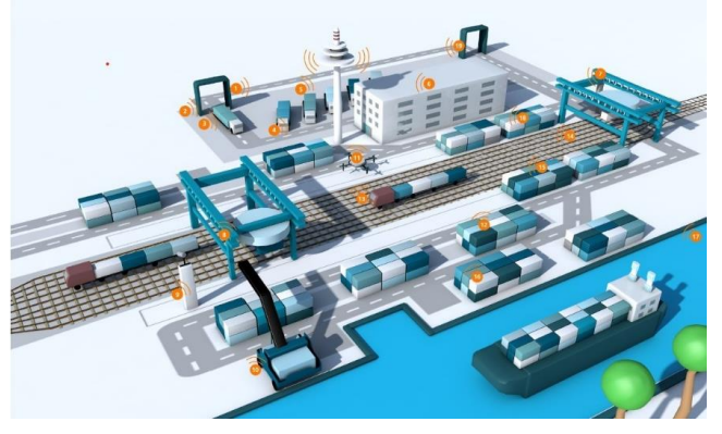
Fig. 4. Visualizing the digital terminal of the future [14]

intelligence – the problem of assigning the right wagon to carry specific loads. The partners are wellknown companies: Deutsche Umschlaggesellschaft Schiene-Straße (DUSS) mbH, VTG Rail Europe GmbH, INFORM GmbH, KombiConsult GmbH, Kombiverkehr and prestigious universities: TU Darmstadt and Goethe University Frankfurt.